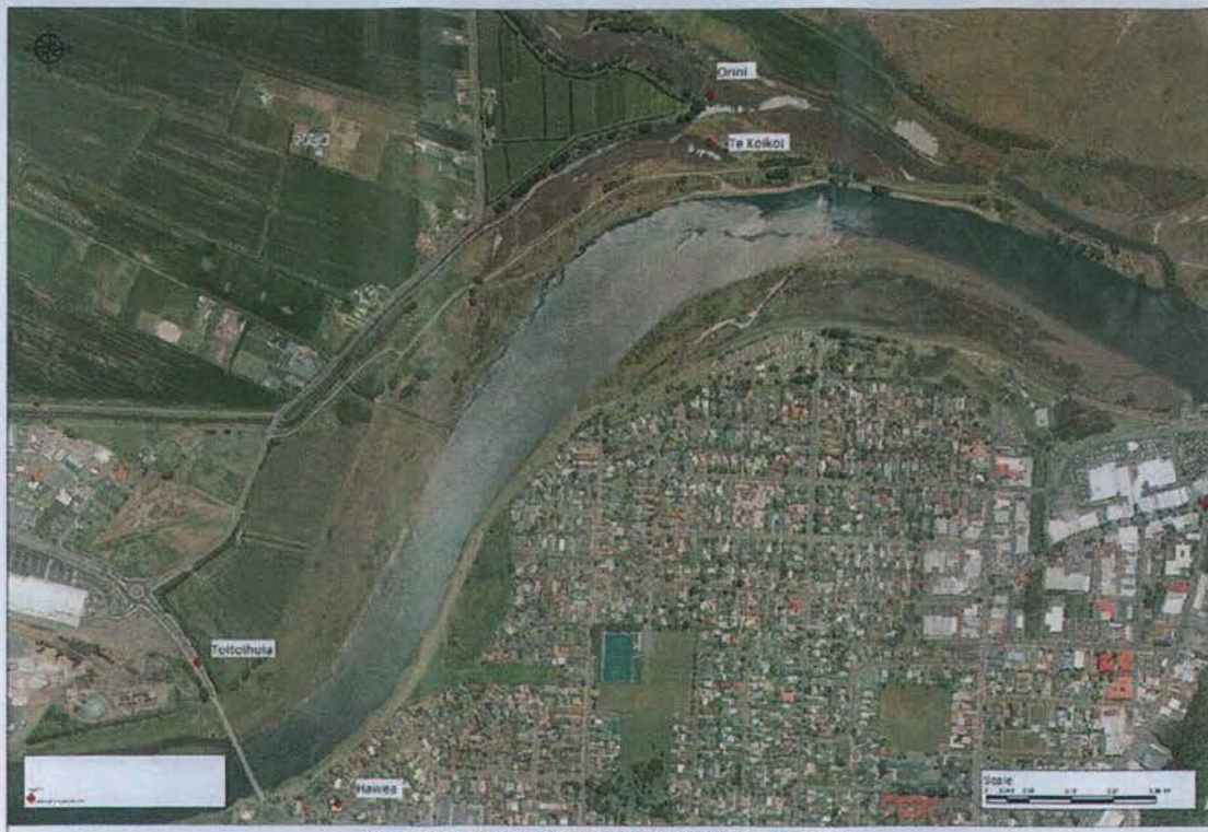
Ngati Awa GIS Database: WHCG BMP Map 1