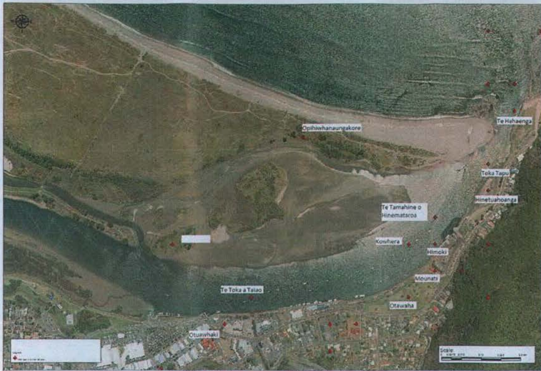
Ngati Awa GIS Database: WHCG BMP Map 2