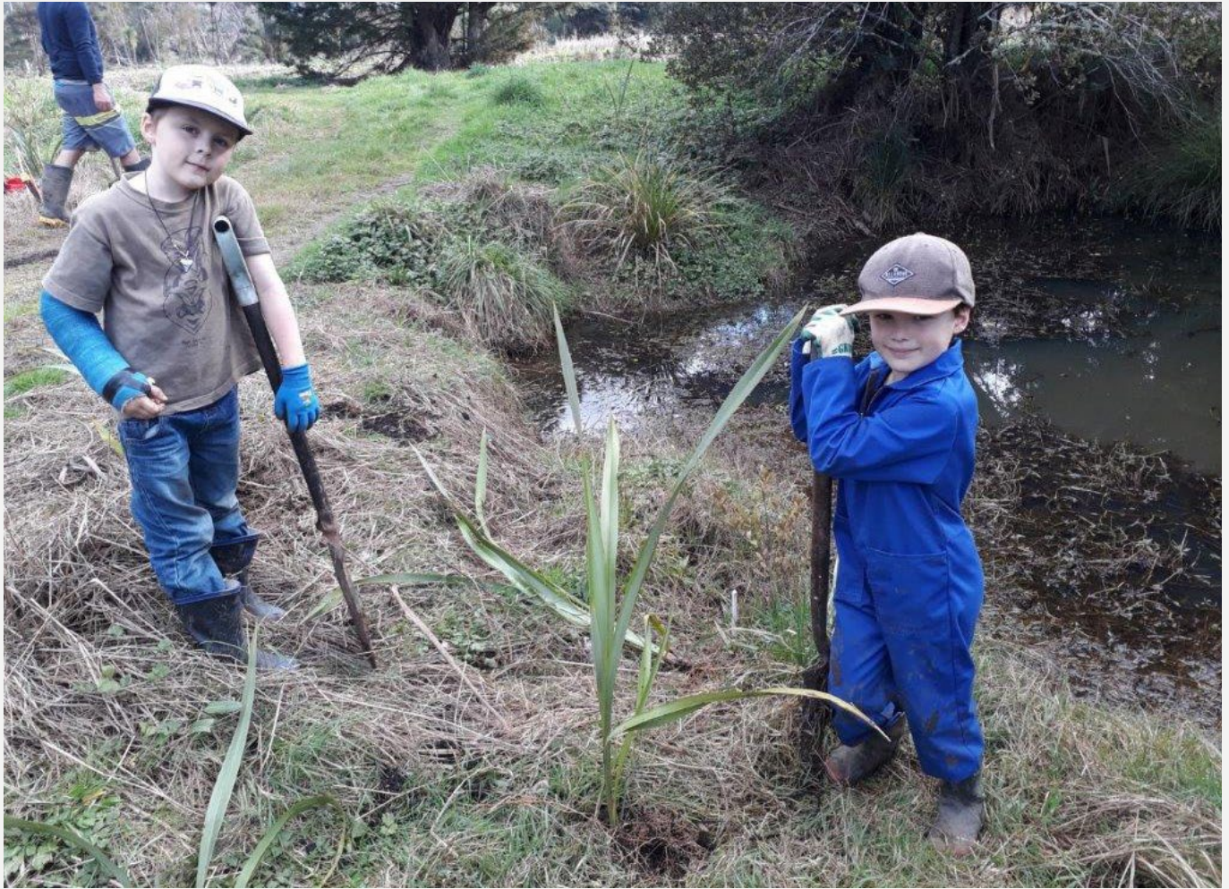
KCC planting day at Matuku Link