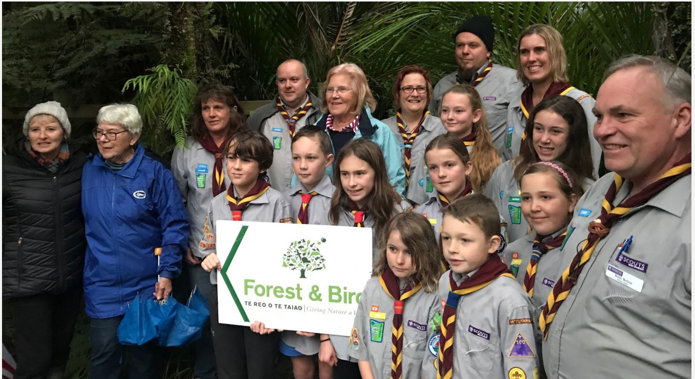
Local scout group Waimauku- Motutara Cubs became kaitiaki of the Colin Kerr Taylor reserve, with the original donors of the land to Forest & Bird on the left.

Wai-o-te-Kauri Stream where the Kauri grows Forest and Bird Waitakere - Newsletter September 2018