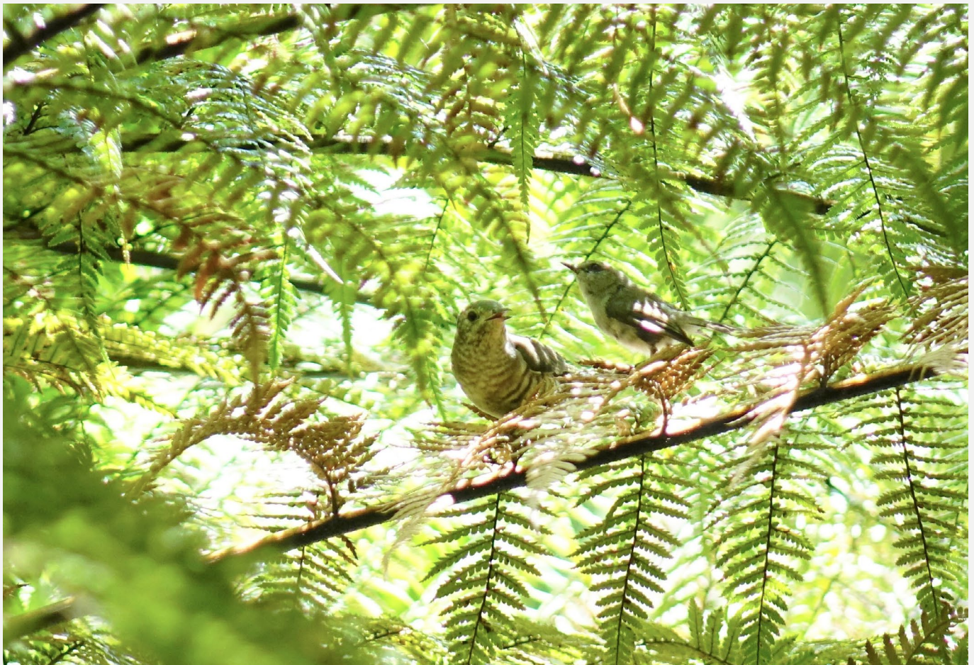
A grey warbler feeds its shining cuckoo foster chick last Spring, photo by Jacqui Geux

As many of you will know recreational access, tourism and conservation work within the Waitākere Ranges has been restricted since December 2017 with the placement of a rāhui. Following this a Controlled Area Notice was applied and all Ark work halted for a period of a month in May. From this we have worked with Council biosecurity and biodiversity staff to gradually re open areas of the Ark and pest control has now almost fully resumed. The next baiting round plus return to the full complement of trapping will be crucial to suppress rat numbers over the bird breeding season in particular.