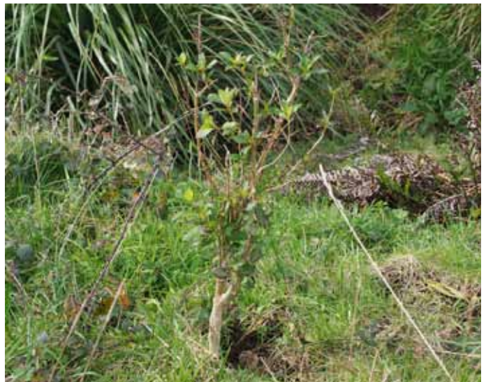
TOP: The good news — one of the new plantings. ABOVE: The not-so-good news — one of our 'pruned' trees.