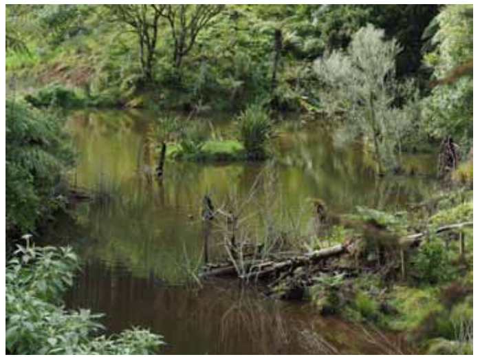
TOP: Visiting the Mills property. Is it a bird? Is it a plane? ABOVE: The lake.