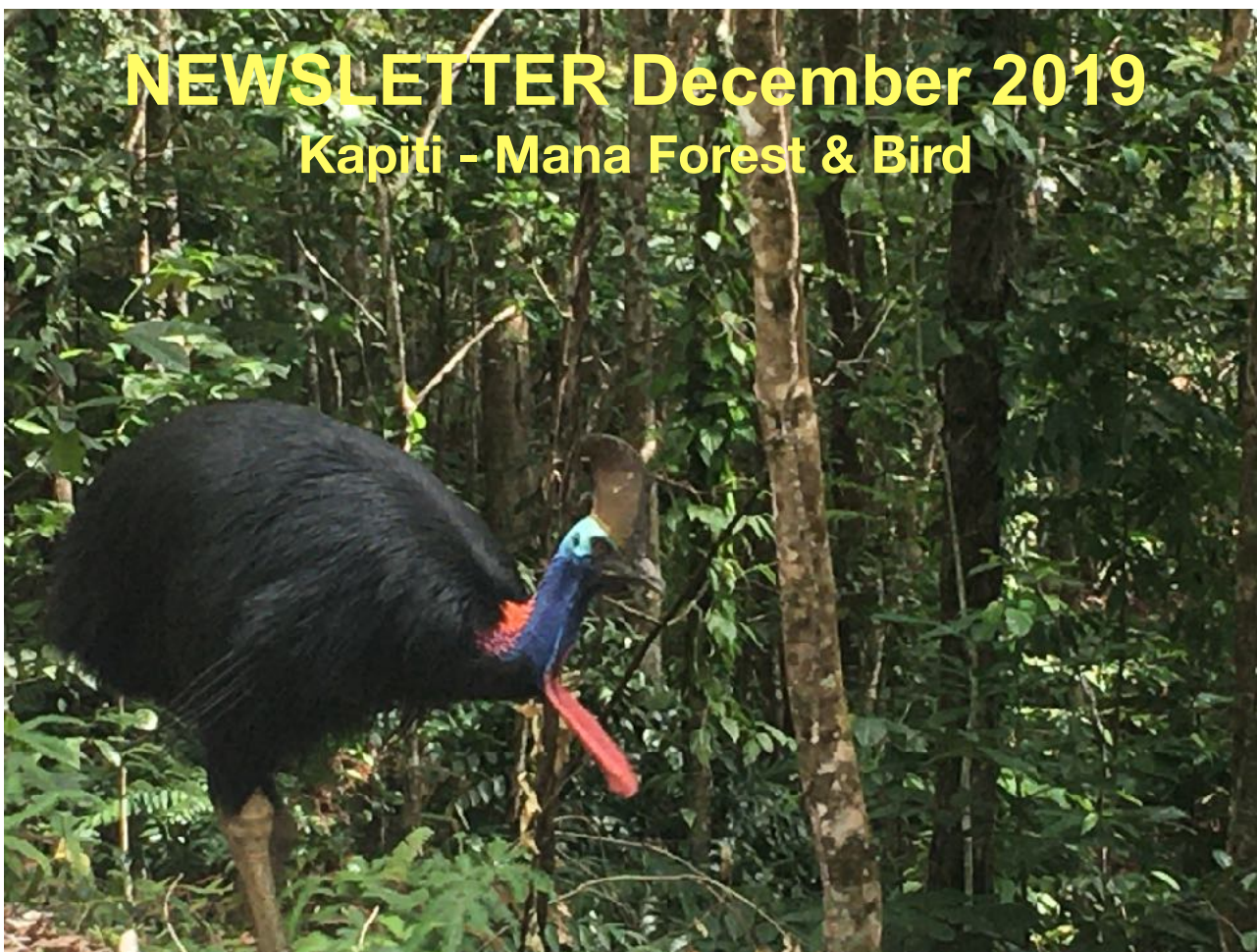
Photo This cassowary is, of course, a native of northern Australia. Without them, many of the trees with large seeds would not be spread around and would remain in isolated pockets of forest. New Zealand has lost all its large species - the moas. What does that mean for our forests or do we not have seeds too big for our wood pigeons?

With every one busy with there is no December meeting. Your committee wish you a very happy Christmas and New Year.