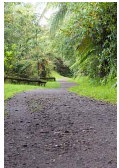
Upper Te Henui stream plantings in days gone by: clockwise from top left: a KCC planting group, June 2011; July 2013: planting the bank further upstream. You won't recognise these areas today; the walkway; 2011 planting.