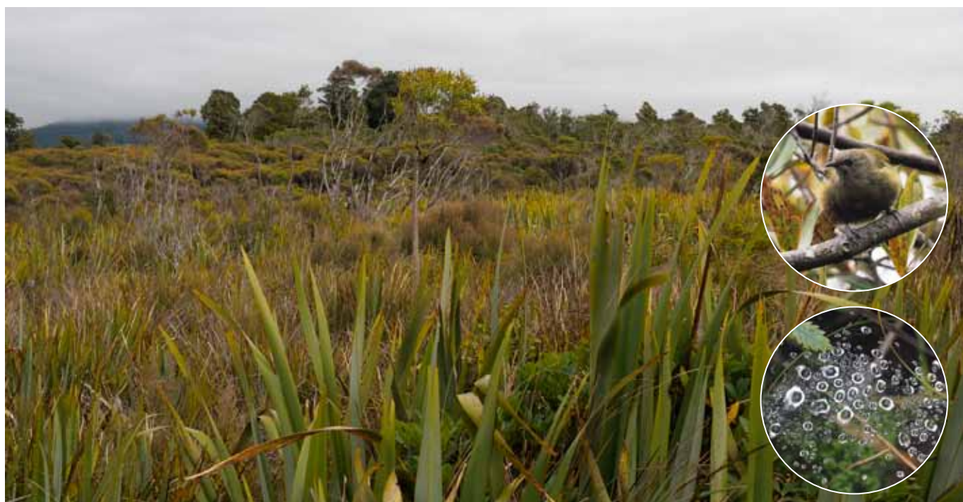
Looking towards the mountain from the viewing platform at Potaema. Inset: korimako/bellbird in the forest walk; waterdrops on a web.