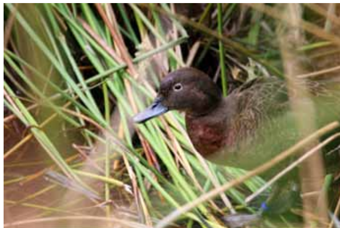
Pateke photographed on Rotoroa Island.

The duck was then lowered down to the water and let go. It headed rapidly away into the safety of the