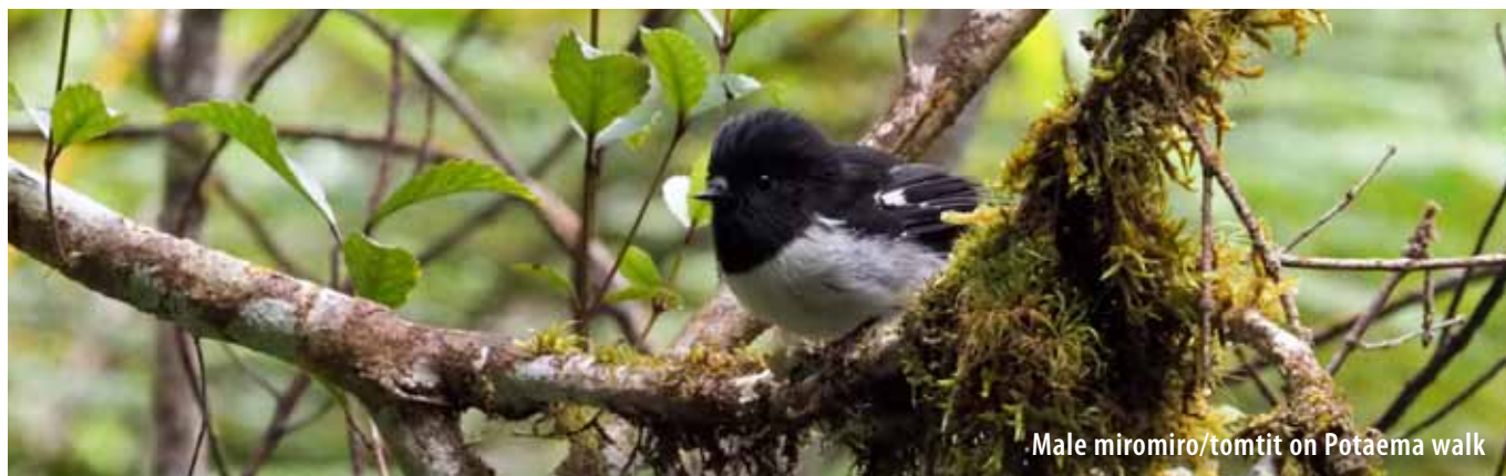
Male miromiro/tomtit on Potaema walk