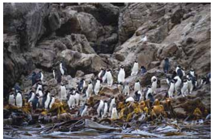
TOP: taking to the waves on the Sub Antarctic Islands expedition; BELOW: Snares crested penguins. See more pics on the back page.

I am very excited and grateful to join the Forest & Bird whānau and I look forward to contributing to the organization's awesome mahi. I'm sure I will meet many of you at F&B gatherings once we're in the green again but until then, stay safe and feel free to get in touch to say hello via email ( e.vanderleden@forestandbird.org.nz ).