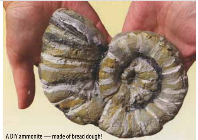
A DIY ammonite — made of bread dough!

North Taranaki branch purchases additional copies of the magazine for distribution around the New Plymouth libraries — check them out at a library near you.