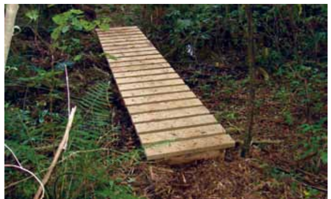
The boardwalk will be constructed along the same lines as the already-existing boardwalk (this was installed in 2011 and has since been lengthened). It will extend across most of the wetland.

As noted previously, this will make the access more weatherproof and will protect the vegetation underfoot, especially in the wettest areas. This will be a long-term project but planning is under way. We will very soon be pegging out the desired route.