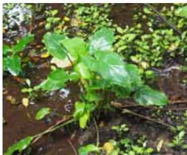
Lily no more. These are now all gone.