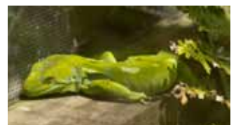
A Wellington green gecko enjoying the sun at Rotokare.

The news that National Office have given the go-ahead to KCC outdoor education events is very welcome. We can now proceed with outdoor activities without masks as long as we meet other expectations.