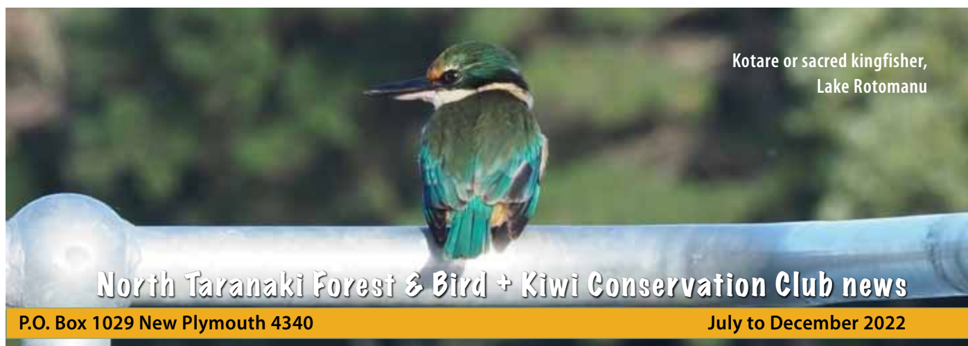
Kotare or sacred kingfisher, Lake Rotomanu