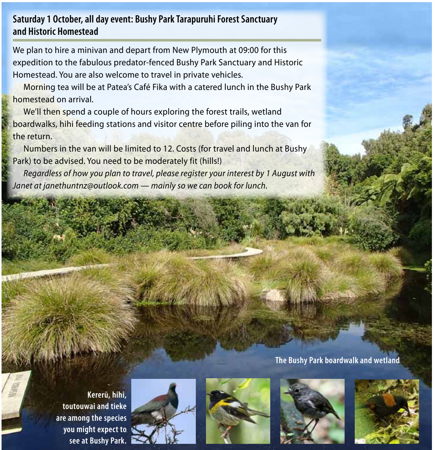
The Bushy Park boardwalk and wetland

Regardless of how you plan to travel, please register your interest by 1 August with Janet at janethuntnz@outlook.com — mainly so we can book for lunch.