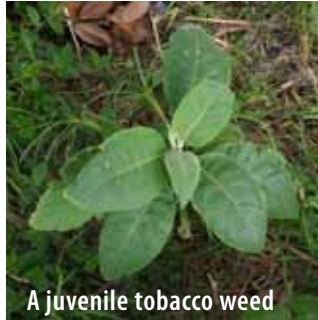
A juvenile tobacco weed

This mature tobacco plant/woolly nightshade was recently removed from inside the fence at Te Wairoa Reserve, along with a number of seedlings. Pesky pest!