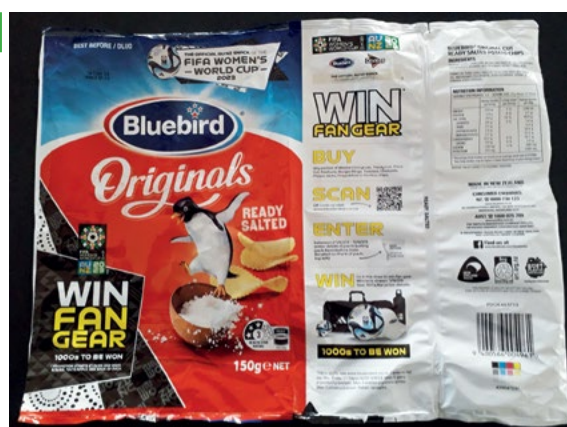
Open both ends of bag and cut down long side to create landscape shape, as shown above.