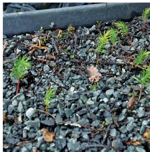
Some tiny little rimu seedlings doing well.