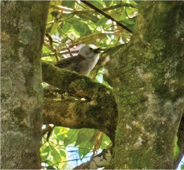
A pōpokotea/whitehead chick checking out the nursery. A parent was around but was less curious than this fellow.