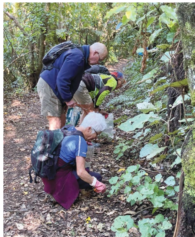
It was a good morning's work collecting seedlings on Johnston's Hill in March.