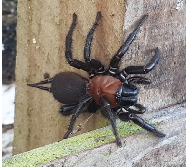
Thanks to Sylvia for this photo of a female funnel web spider pottering around a potting shed. They can bite!