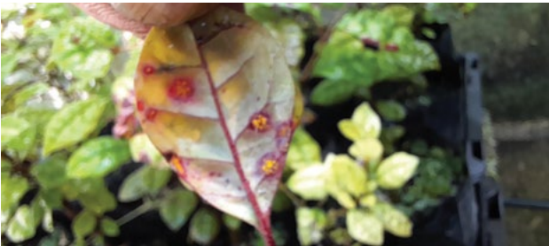
Myrtle rust has hit the ramarama so all 30 plants have had to be destroyed.