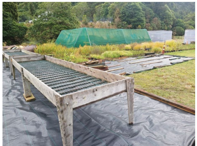
Left: From time to time there are problems with deer at the Wainuiomata Nursery. This photo shows the tops of the five finger chewed off. They have also nipped the growing taupata and karamu. It may be time to build a fence. Right: This photo shows the expanded standing-out area with additional plant stands. The irrigation system will be expanded to cover the new area.