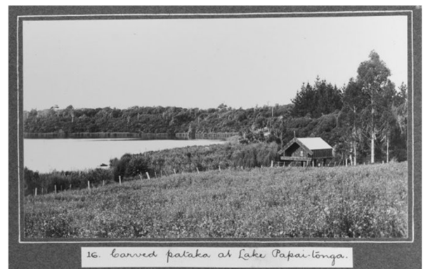
16. Carved pataka at Lake Papaitonga.