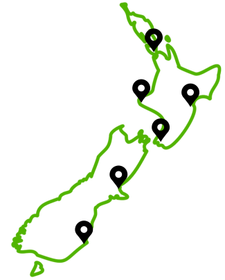
Location Hubs (September 2024)

Some Hubs meet in person to manage projects, run events, and lead efforts in conservation and restoration. Others meet online to discuss environmental issues, run advocacy campaigns, or create material for education and awareness.